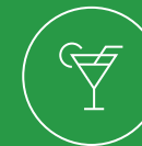
Cafe & Juice Bar