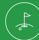
Open-Air Golf Simulator